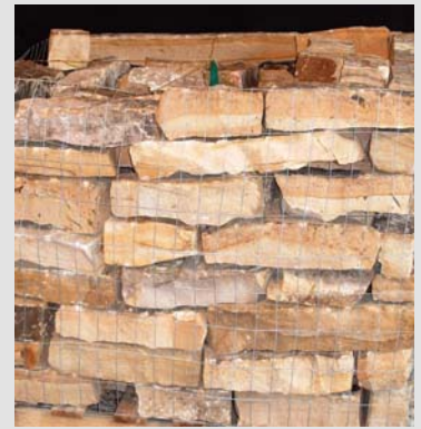
Shawnee Strip Rubble Fieldstone