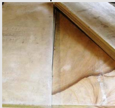
TN Variegated 6-Sided Sawn Treads