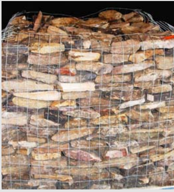
Shawnee Thin Stack