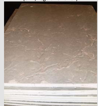
Blue/Gray Shell Rock