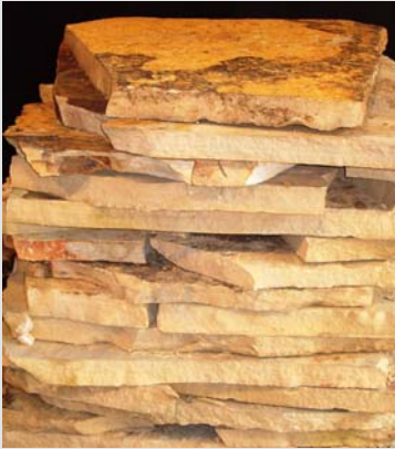
TN Variegated Flagging (thin, regular or thick)

Geo. Schofield Co., Inc., is a full service quarrier, fabricator and supplier of Tennessee wallstone, flagstone, building stone, steps, and boulders. Our business was founded in 1923 and over the past 85 years we have earned a reputation for reliability and integrity. We welcome the opportunity to introduce you to our products and look forward to providing you with additional information, product samples, quotations and consultation services. Our customer service team includes both outside sales and inside sales staff. We are 100% committed to responding to the needs of our customers, ensuring quality, and delivering exactly what you need, when you need it.