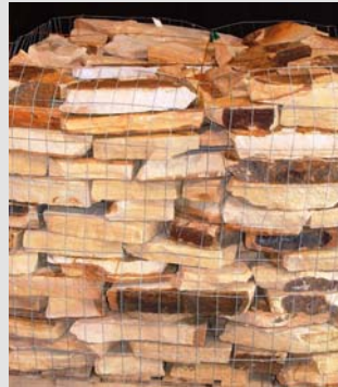
TN Variegated Quarry Stack Heavy