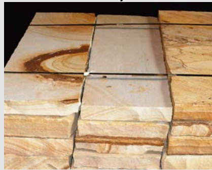
TN Variegated 12" Step Treads