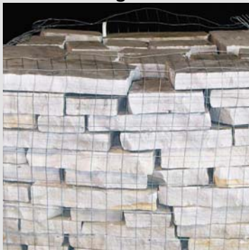
TN Blue/Gray Ashlar (3"-5" thick)