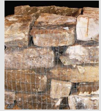
Shawnee Thick Stack