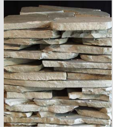
TN Blue/Gray Flagging (thin, regular or thick)