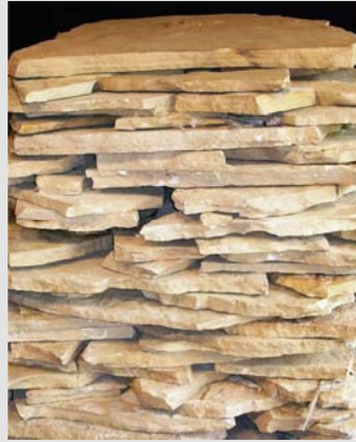
TN Tan Flagging (thin, regular or thick)