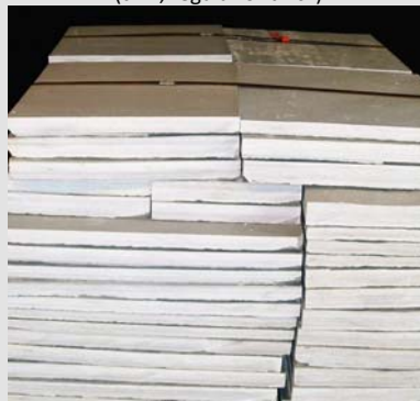
TN Blue/Gray Flooring Pattern