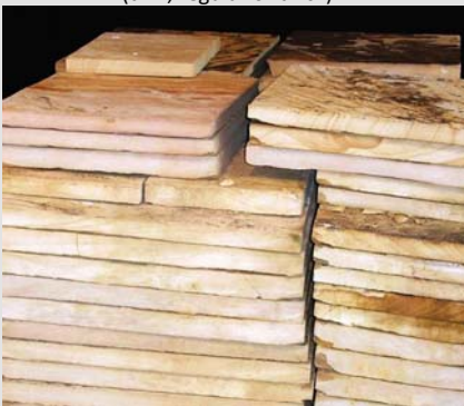
TN Variegated Flooring Pattern