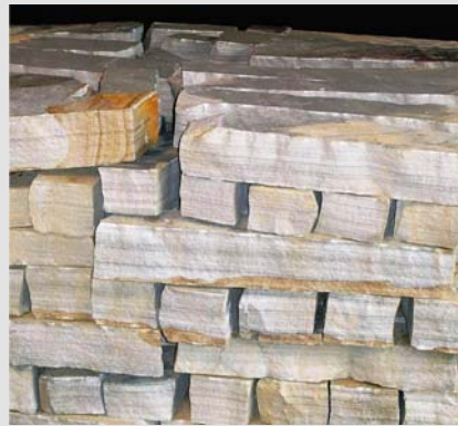
TN Blue/Gray Strip Rubble (3"-6" thick)