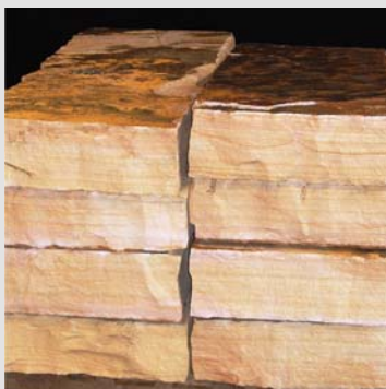
TN Variegated 18"x36" Step Treads