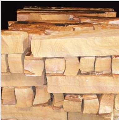
TN Variegated Strip Rubble (3"-6" thick)