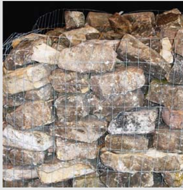
Shawnee Medium Stack