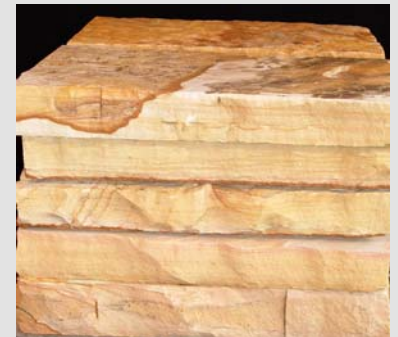
TN Variegated 18"x48" Step Treads