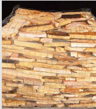
TN Variegated Quarry Stack Regular